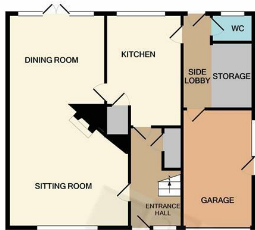
GROUND FLOOR APPROX. FLOOR AREA 630 SQ.FT. (58.5 SQ.M.)