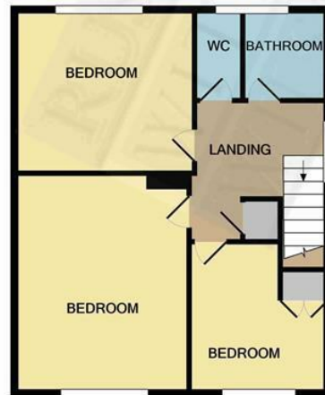
1ST FLOOR APPROX. FLOOR AREA 448 SQ.FT. (41.6 SQ.M.) TOTAL APPROX. FLOOR AREA 1078 SQ.FT. (100.2 SQ.M.)

Whilst every attempt has been made to ensure the accuracy of the floor plan contained here, measurements of doors, windows, rooms and any other items are approximate and no responsibility is taken for any error, omission, or mis-statement. This plan is for illustrative purposes only and should be used as such by any prospective purchaser. The services, systems and appliances shown have not been tested and no guarantee as to their operability or efficiency can be given Made with Metropix ©2021